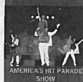
AMERICA'S HIT PARADE SHOW

Diamond Tours inc. Bringing Group Travel to a Higher Standard®